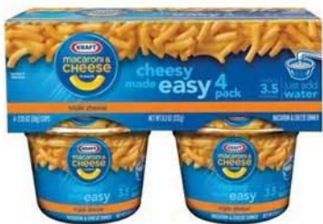
Mac & Cheese